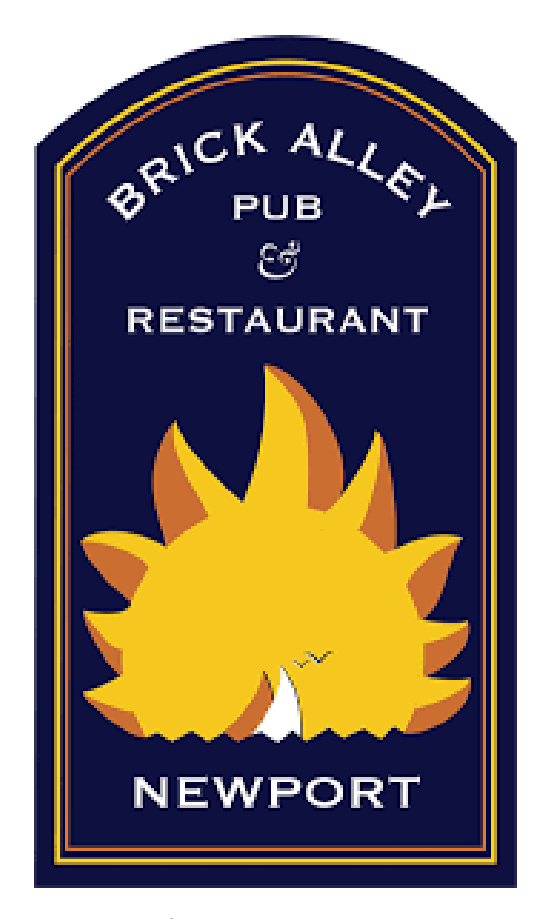
140 Thames St, Newport BrickAlley.com